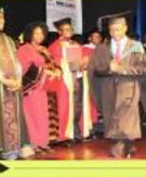
Several graduates were awarded first class degrees and distinctions