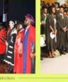
Jackie Muzema, Minister of Education with distinction