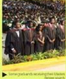
Venerated guests receiving their Master's degree awards