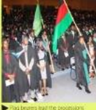
Flag bearers lead the procession