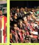
Some of the MZU staff and dignitaries