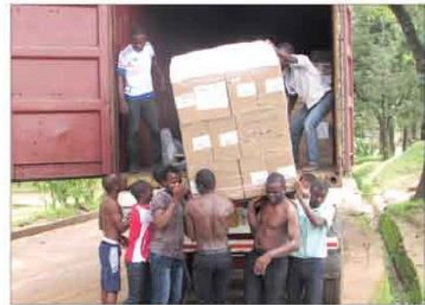
Students help to offload a truck load of books and equipment donated by Virginia Tech

The Chancellor, His Excellency Professor Arthur Peter Mutharika also personally donated resources for the renovation of the library and Government has additionally provided MK200 million in 2016/17 to assist library reconstruction.