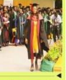
Some of the graduates who were awarded Masters in Leadership