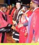
MZU staff procession - HPL LIBRARY