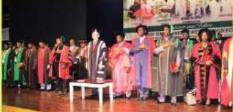
MCU officials and dignitaries sing the national anthem to mark the beginning of the Ceremony