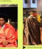
Members of MZU Council observe the proceedings