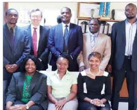
Mzuni and Old Mutual Management Teams after a successful Mathematics Olympiad

This shared intellectual activity also helps encourage scholarly collaborations with local and