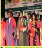
Members of MZU Council observe the proceedings