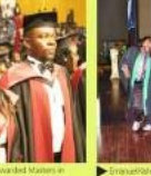
MZU staff procession - HPL LIBRARY