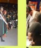
Flag bearers lead the procession