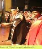
Some of the MZU staff and dignitaries