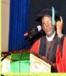
Hon. Winston Kankole