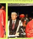
Hon. Winston Kankole